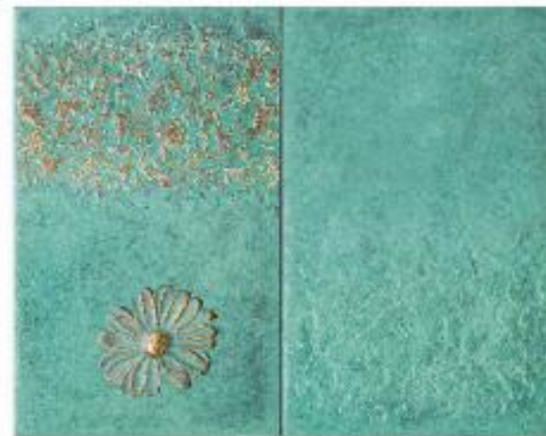
Special patina »Strong Green«