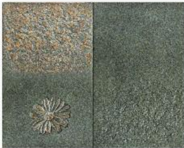
Special patina »Light Green«