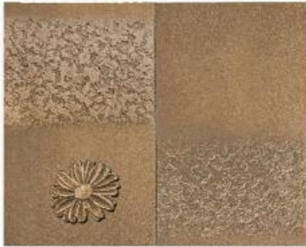
Standard patina »Light Brown«