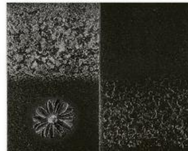
Standard tint »Dark Grey«

Depending on design and surface structure, the tint can have a different effect.