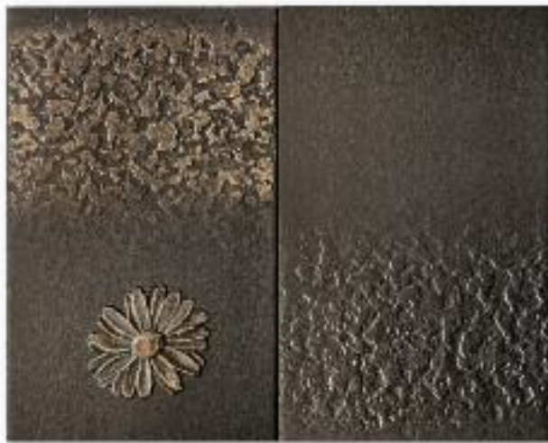
Standard patina »Dark Brown«

Depending on design and surface structure, the patina can have a different effect.