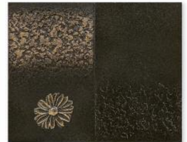
Special patina »Black«