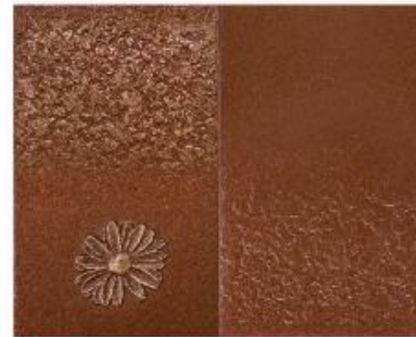
Special patina »Red«