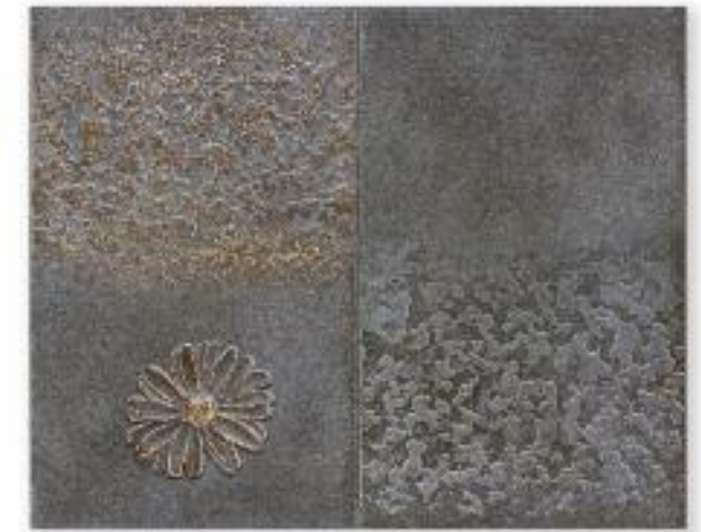
Special patina »Ash«