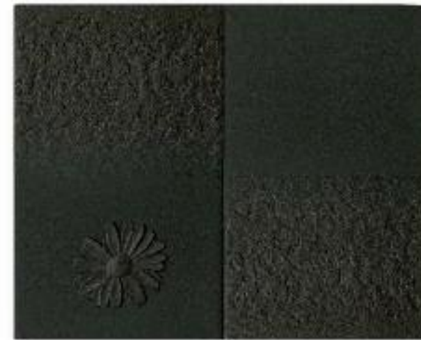
Special patina »Old«