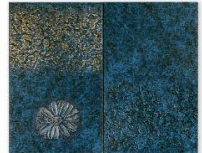
Special patina »Blue«