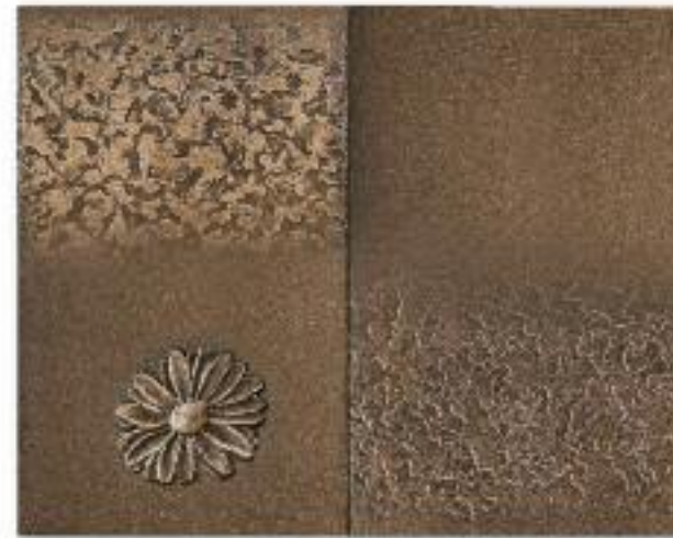
Standard patina »Brown«