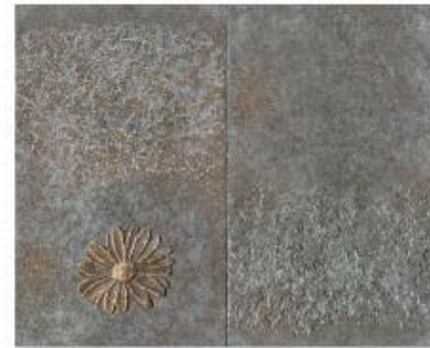
Special patina »Lost wax patina«